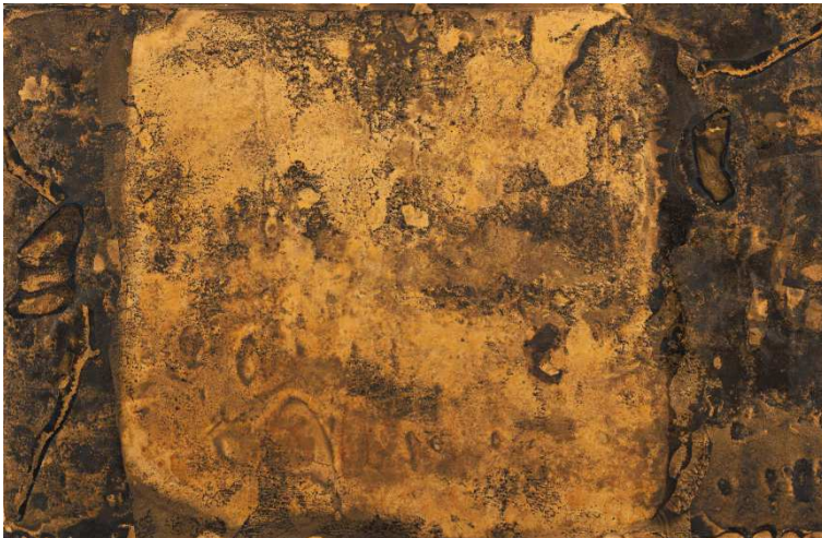
Jean DUBUFFET Aire médiane claire, 1949 Collage, oil and ink on paper laid canvas 49,5 x 76 cm