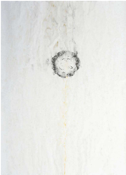
Pauline de BAZIGNAN 17 mars 2014, 2014 Acrylic on paper Heritage woodfree 100g 114 x 83 cm