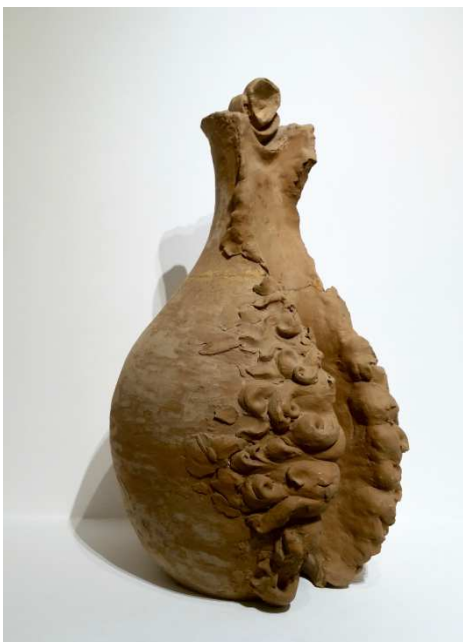
Giuseppe PENONE Breath, 1978 Terracotta Hauteur : 74,5 cm