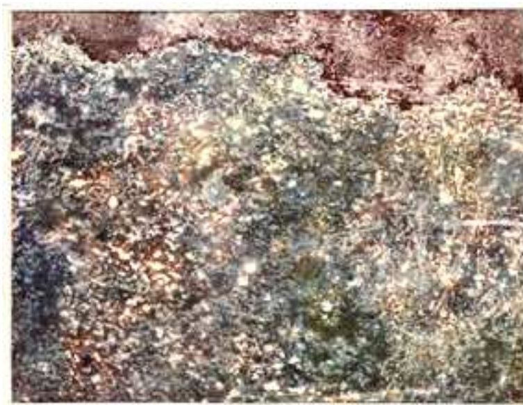
Jean DUBUFFET Paysage tavelé ciel rougeâtre, 1954 Oil on paper 49 x 63,5 cm