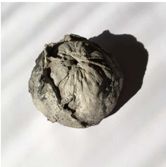
Pauline de BAZIGNAN Intérieur, 2016 Ceramic H: around 8 cm Several pieces exhibited with diferent colours and variable sizes