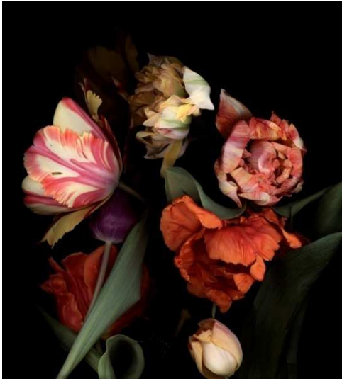
Luzia SIMONS Stockage 116, 2011 Scannogramme Light Jet Print/Dlasec 140 x 126 cm Ed/5