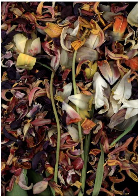
Luzia SIMONS Stockage 124, 2011 Scannogramme Light Jet Print/Dlasec 177 x 122 cm Ed/5