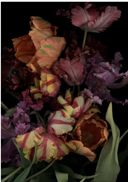
Luzia SIMONS Stockage 155, 2014 Scannogramme Light Jet Print/Dlasec 60 x 42 cm Ed/15