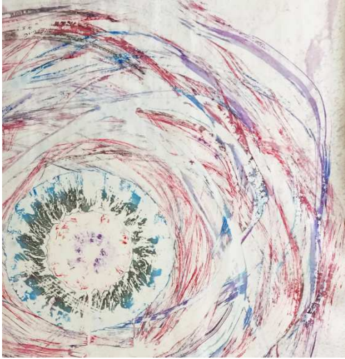
Pauline de BAZIGNAN 27 avril 2016, 2016 Acrylic on paper Heritage woodfree 315g 136 x 101 cm