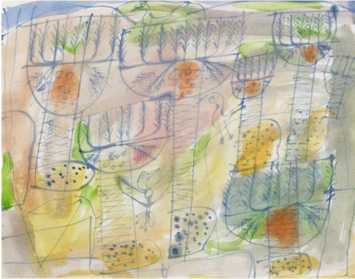
Jean DUBUFFET Palmeraie aux trois oiseaux, 1949 Watercolor, pencil and ink on paper 21 x 26 cm